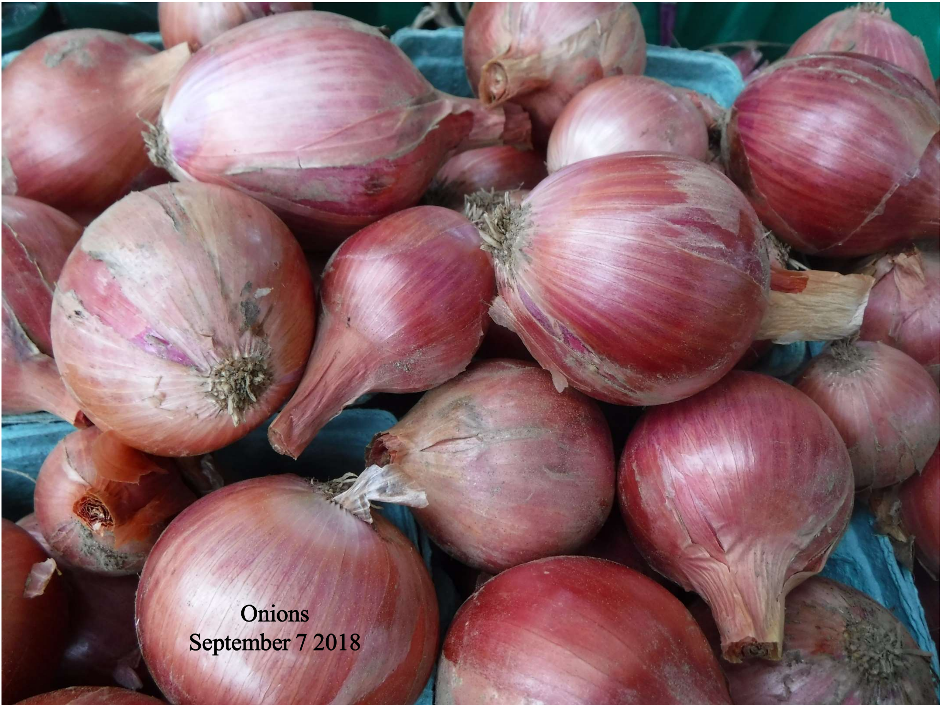
Onions September 7 2018